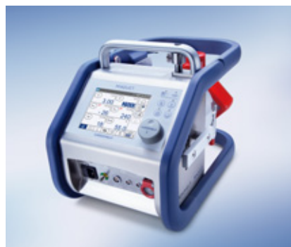
Fischer Connectors created a unique solution for the Maquet CARDIOHELP

We connect not only with clients who build devices, but with the people – the doctors, nurses and operators – who use them on a daily basis and need proven reliable connectors when a life is on the line.