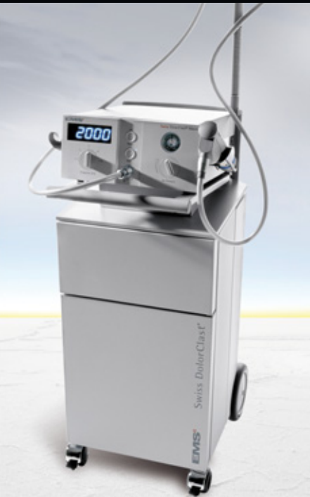
EMS uses Fischer Core Series for its Swiss DolorClasT®